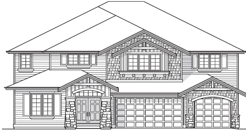
LOT 24 OXFORD