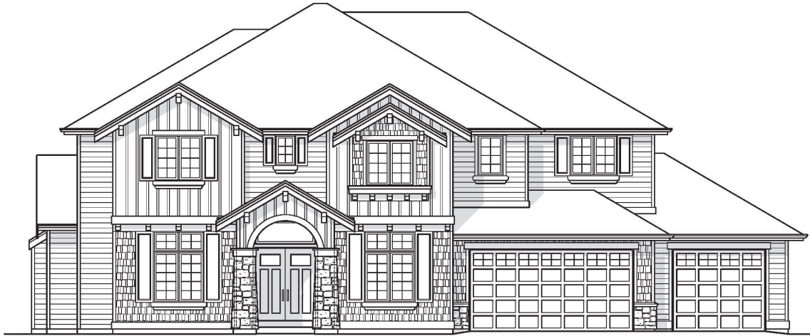
LOT 9 RADCLIFF