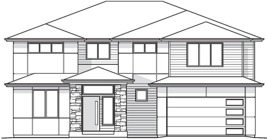
LOT 01 SAYWARD