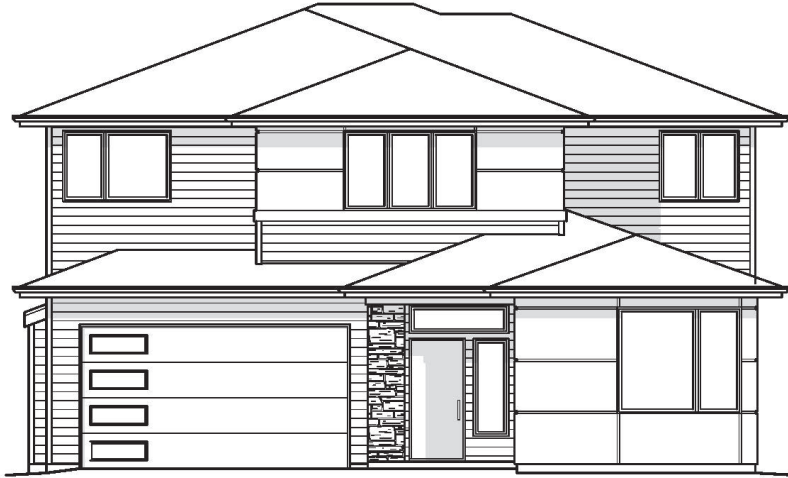
LOT 01 SAYWARD